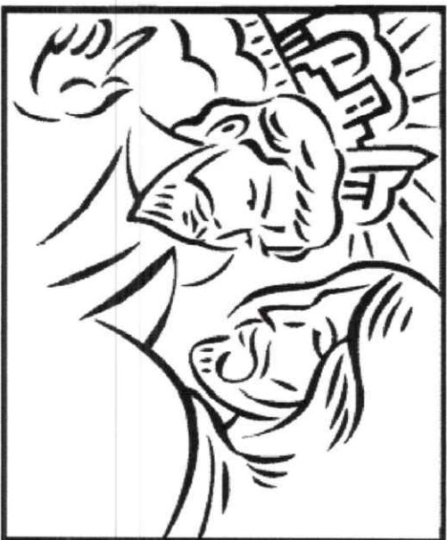
Jesus tempted by the Devil