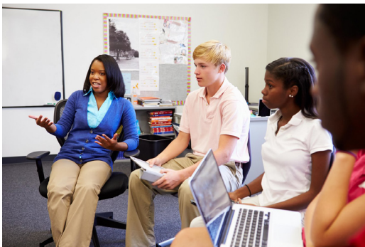
How do you respond in situations of conflict or debate?

No one likes conflict, but imagine getting into conflict with Jesus! Granted, Jesus seems to be saying some challenging things and perhaps Peter felt justified in trying to talk him down, but Jesus takes a pretty hard line with Peter. How might observers of this conversation have responded? Whose side would you have taken? Would you speak up and make your views known in a situation like this, or listen and silently disagree?